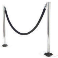
Velour Rope 6' Black A40