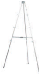
Tripod Easels A20