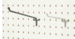
Pegboard 6" Single Hook D11