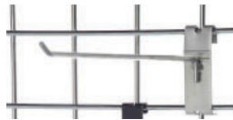
Gridwall 6" Single Hook D60