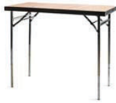
4' Display Table F220 42" Counter High