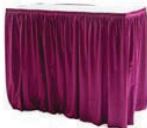
4' Display Table