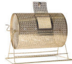
Raffle Ticket Drum A106