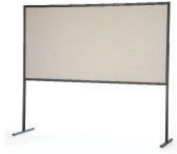
Tackboard Panels (4'x8') D30