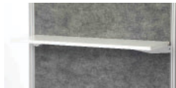
Shelf 1 meter wide D130