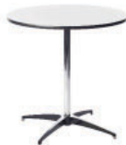
30" Diameter Pedestal F90 30" H (Gray)