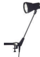
Arm Light D220