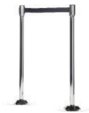
6' Tensabarrier A110