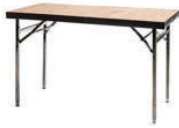
4' Display Table F190 30" High