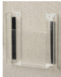
Acrylic Holder D210