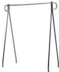
Garment Rack 5' A80