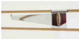
Slatwall 8" Bracket D121