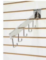
Slatwall Waterwalls Hooks D120