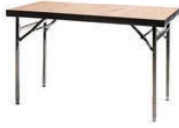
4' Display Table F190 30" High